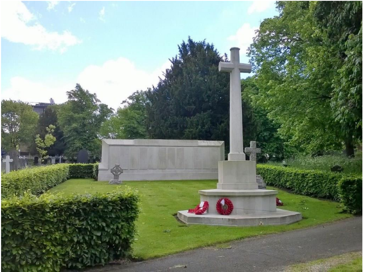
Cross of Sacrifice & Screen Wall in Welford Road Cemetery, Leicester