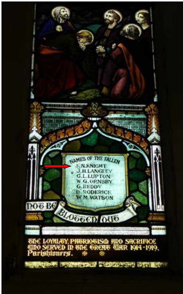
Christ Church War Memorial Stained Glass Window, Castlemaine