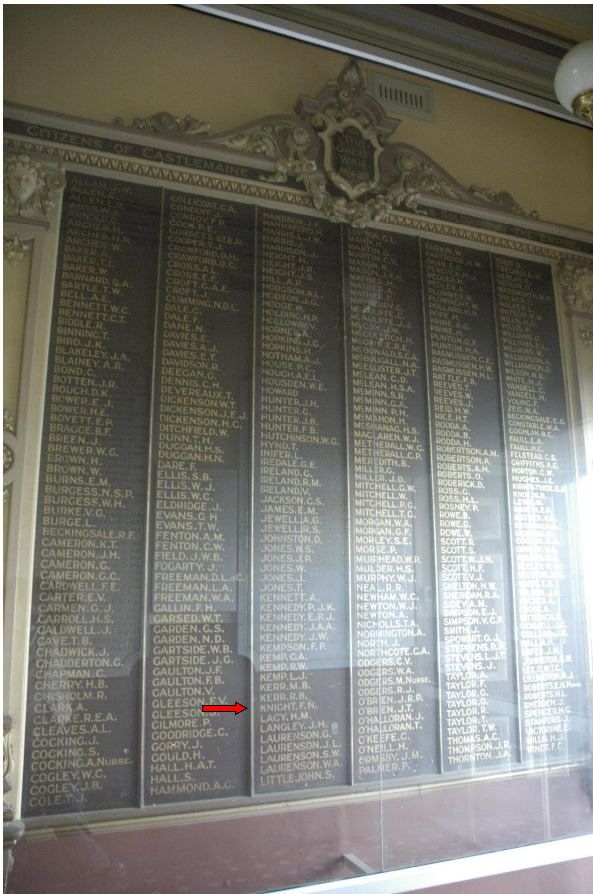
Castlemaine Town Hall Honour Roll

F. N. Knight is remembered on the Castlemaine Town Hall Honour Roll, located at Castlemaine Town Hall, 48 Lyttleton Street, Castlemaine, Victoria.