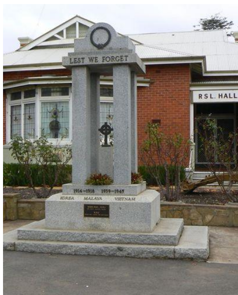
Castlemaine War Memorial

The Castlemaine War Memorial, located in front of RSL Hall, 36 Mostyn Street, Castlemaine, Victoria, does not have individual names.